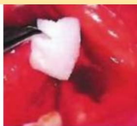
TOOTH EXTRACTIONS Oozing bleeding from alveolus is stopped by application of SURGISPON® Dental cube.