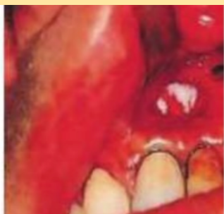
DETAIL Dental cube place in cavity.

To achieve immediate hemostasis in: - Extractions & Oral bone and soft tissue surgery (No Iodine & packed individually)